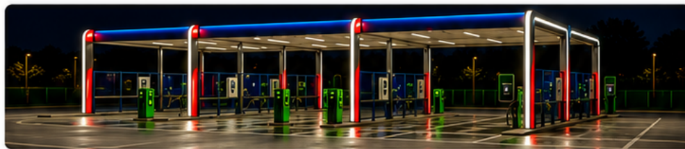
Indicative view of the proposed self-service vehicle valeting bays.